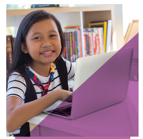
Strengthen Instruction with Tutoring & Intervention