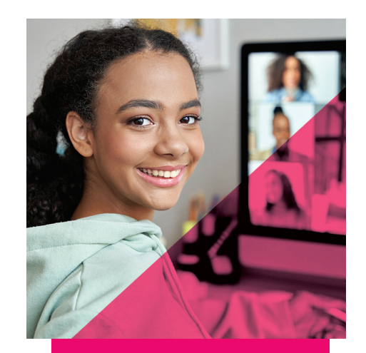
Address Staffing Shortages & Expand Access to Course Options

Virtual instruction opens a world of educational opportunity poised to combat your greatest challenges, but not all virtual learning is created equal. At Edmentum, we'll partner with you to deliver proven instructional services that expand access and drive results.