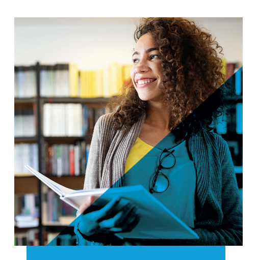
Build Capacity & Maximize Teacher Talent